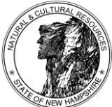
NH Dept of Natural and Cultural Resources

Public Comment Session – related to agenda items