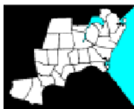
Rockingham Planning Commission