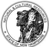
NH Dept of Natural and Cultural Resources