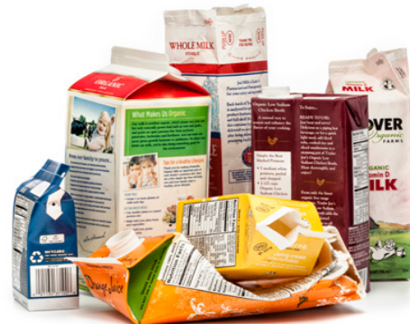
Food & Beverage Cartons