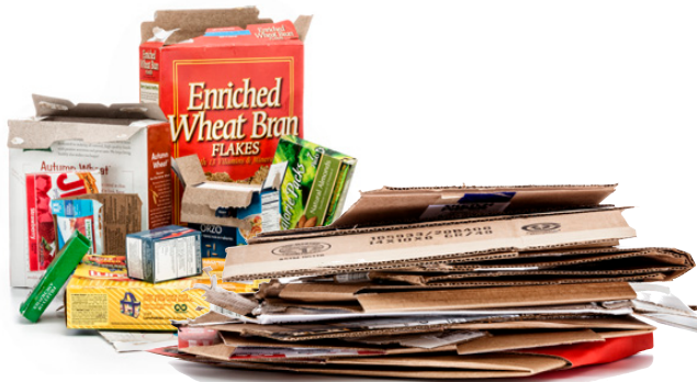
Cardboard & Paper